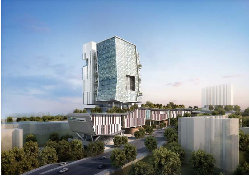
The exterior design of AC3